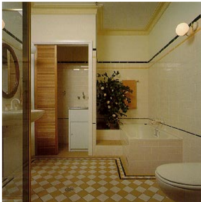
The Wet-seal System for wet areas.