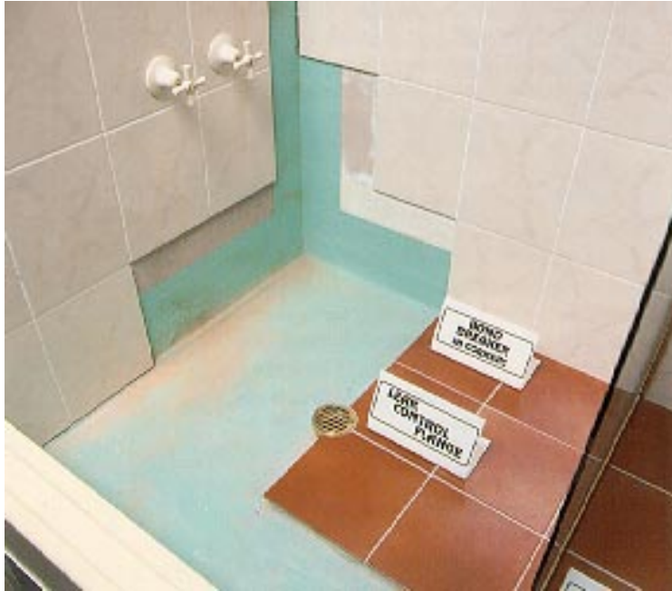
The Wet-seal System.

In the opinion of BRANZ, the Wet-seal System Waterproofing Membrane is fit for purpose and can be used to meet the relevant provisions of the Building Code provided it is used, designed, installed and maintained as set out in this Certificate.